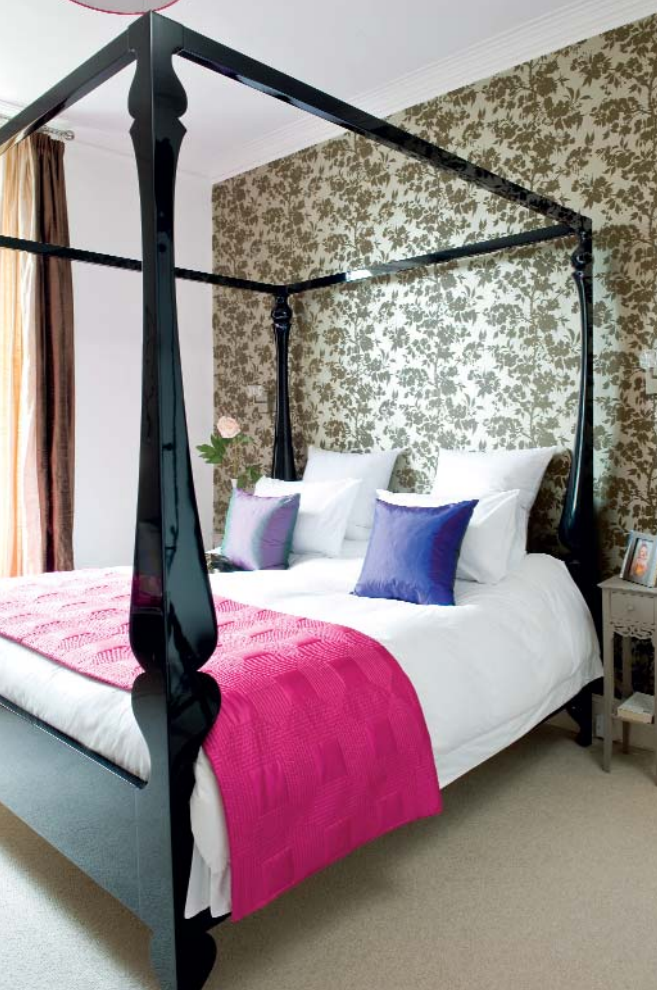
Left: Emma has mixed colours to great effect in the bedroom, which is dominated by a four poster bed. Bold accent wallpaper creates a lively backdrop to the furniture Below: Blanket box, made by Eye Candy Interior Design is covered in Casamance fabric. Ghost chair from Ice Interiors, wall lights from Graham and Green, pink throw from Next