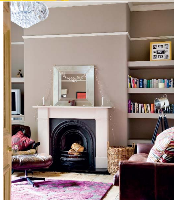
Left and below: Osborne and Little Sakura wallpaper on the chimney breast and Marston and Langinger's Portland on the walls. All the woodwork is Farrell & Ball Clunch. Side table is from Ice Interiors Top The Audrey Sunrise stair carpet is from Crucial Trading. The yellow sideboard is from IKEA. Habitat framed photographs add simple but striking finishing touches Right: Zoffany Taupe walls, halo sofas and an Eames style chair and footstool from Havershams Interiors create a Gentleman's Club atmosphere in this sitting room